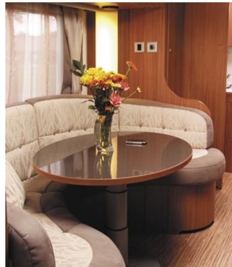
A lovely, comfortable dining area opposite the kitchen

plus four burners. There's no microwave, which some will miss in a caravan of this price by comparison with British-made alternatives. There is, though, ample kitchen storage space, in the form of a great sweeping curve of four cabinets at head height plus three deep drawers and a drop-down-front cupboard between the Thetford fridge and oven. A further drawer is above the heater to the left of the fridge.