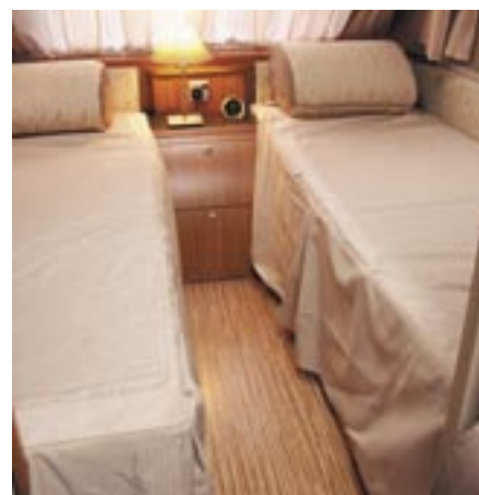
Twin beds – unusually in the front of the caravan

Cooking equipment is a full oven and grill,