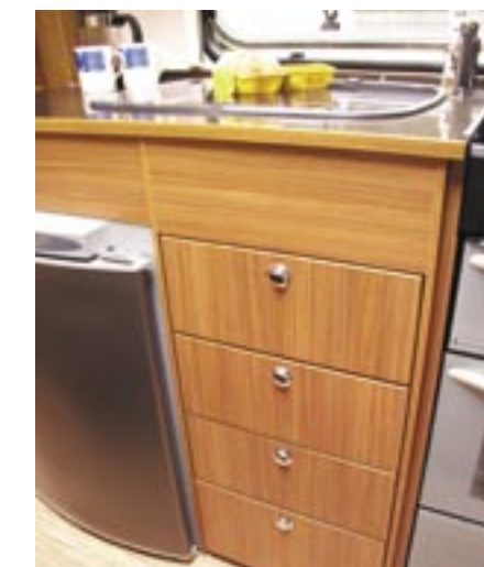
Three deep drawers and a drop down cupboard

Lighting is a feature, in more ways than one, of the two 2010 Advia models (the alternative has a fixed double bed instead of the twin beds). All lighting is 12-volt. Above the table is an elliptical fitting into which is mounted three tungsten circular lights plus eight tiny LED bulbs. And there's more. At each corner of the semi-circular seating are curved frosted plastic sections which cleverly disguise lights, reaching from the base of the lockers right down to behind the seating. The