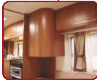
Half-length wardrobes over the end of each twin bed save space - and offer a surprising amount of room