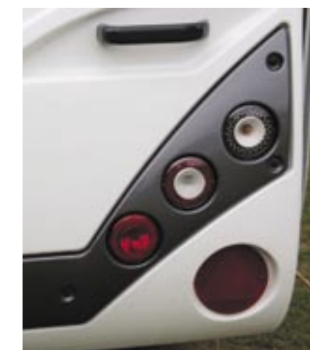
Grey-mounted tail lights look stunning

bedroom has two spotlights plus subdued lighting in the form of LEDs disguised behind a matt-metal-effect pelmet that runs along the tops of all three windows.