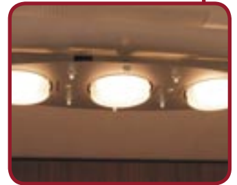
A triple array of LED lights around a stylish plinth enhance the central dining area