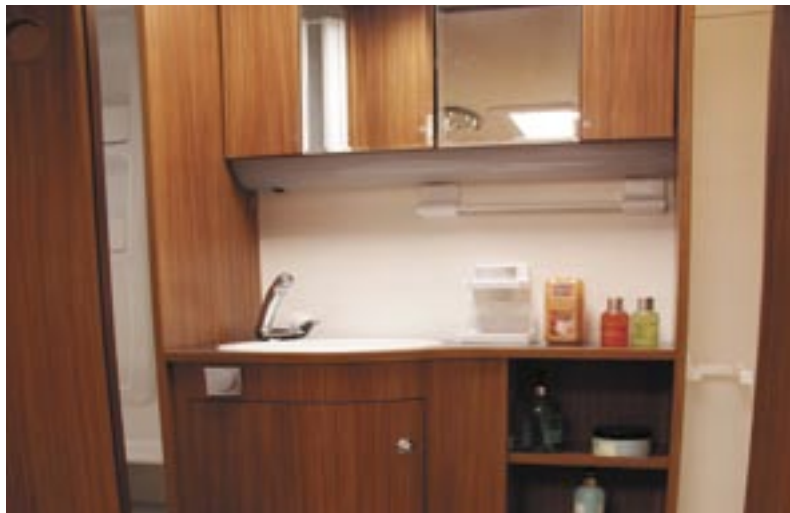
Plenty of shelving and cupboards