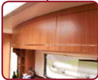
Curved lockers over the kitchen are mirrored by reverse curved lockers over the table