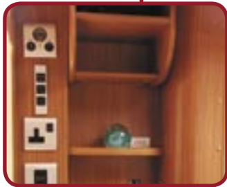
Useful shelves, a bank of power controls and a mains socket are all close to the kitchen